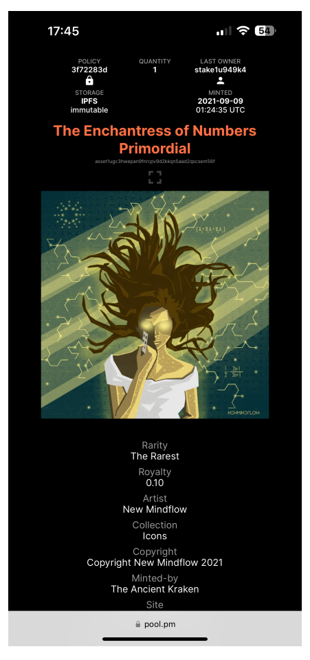
pool.pm Mobile - Enlarged NFT w/ Metadata Details