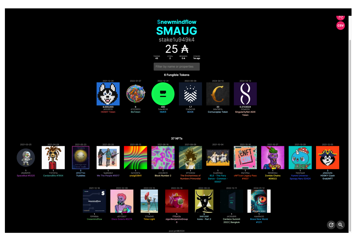
pool.pm Desktop - Wallet Contents Overview